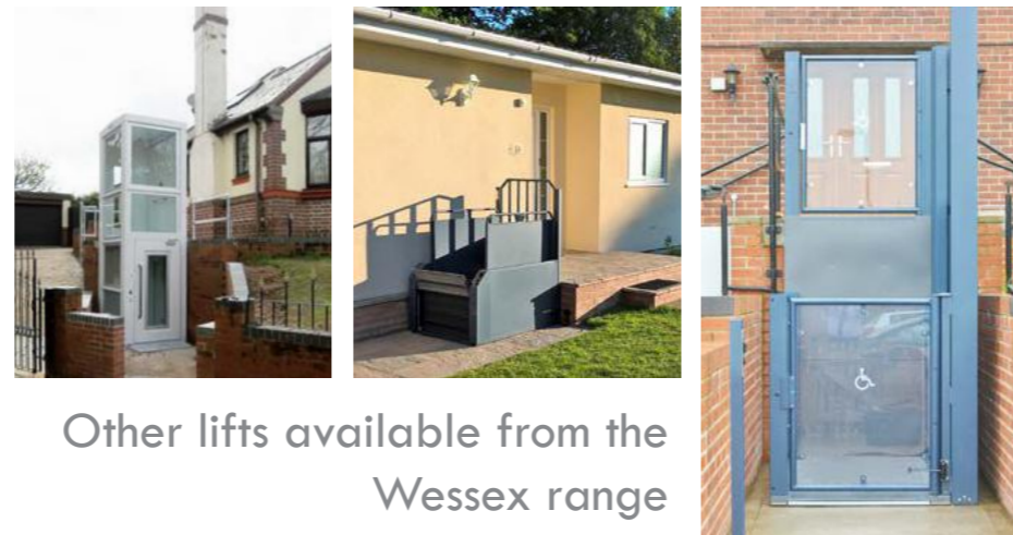
Other lifts available from the Wessex range