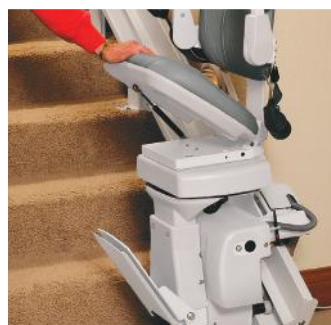
Power folding footrest automatically flips up/down when seat is raised/lowered.