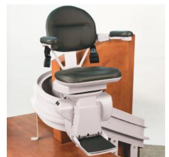
Mid-park and charge station for staircases with middle landings.